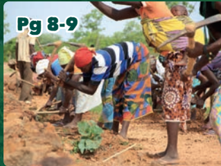
The Great Green Wall