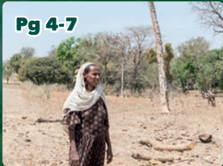
Spotlight on Ethiopia